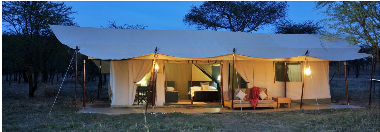
Ewanjan Camp x2

Two days spent exploring the Serengeti. Full day game drives with packed lunches or shorter game drives returning to camp for lunch depending on your preferences and the advice of your guide. Evenings around the camp fire followed by dinner under the stars. Optional Balloon early morning balloon safari.